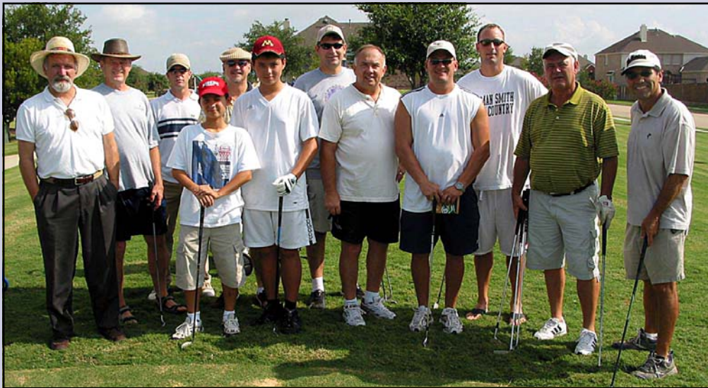
Tournament Players on July 21st