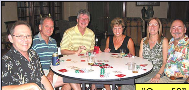
"Over 50" Poker Night