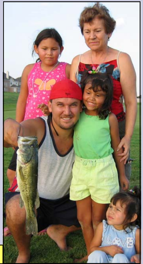
The winning fish - 16.5"