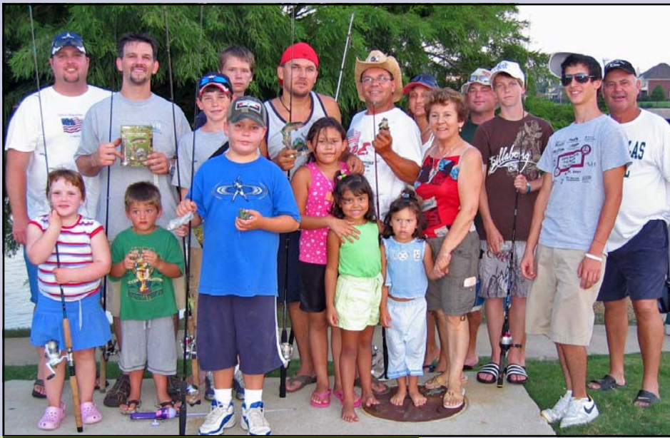
Tournament Anglers on Aug 4th