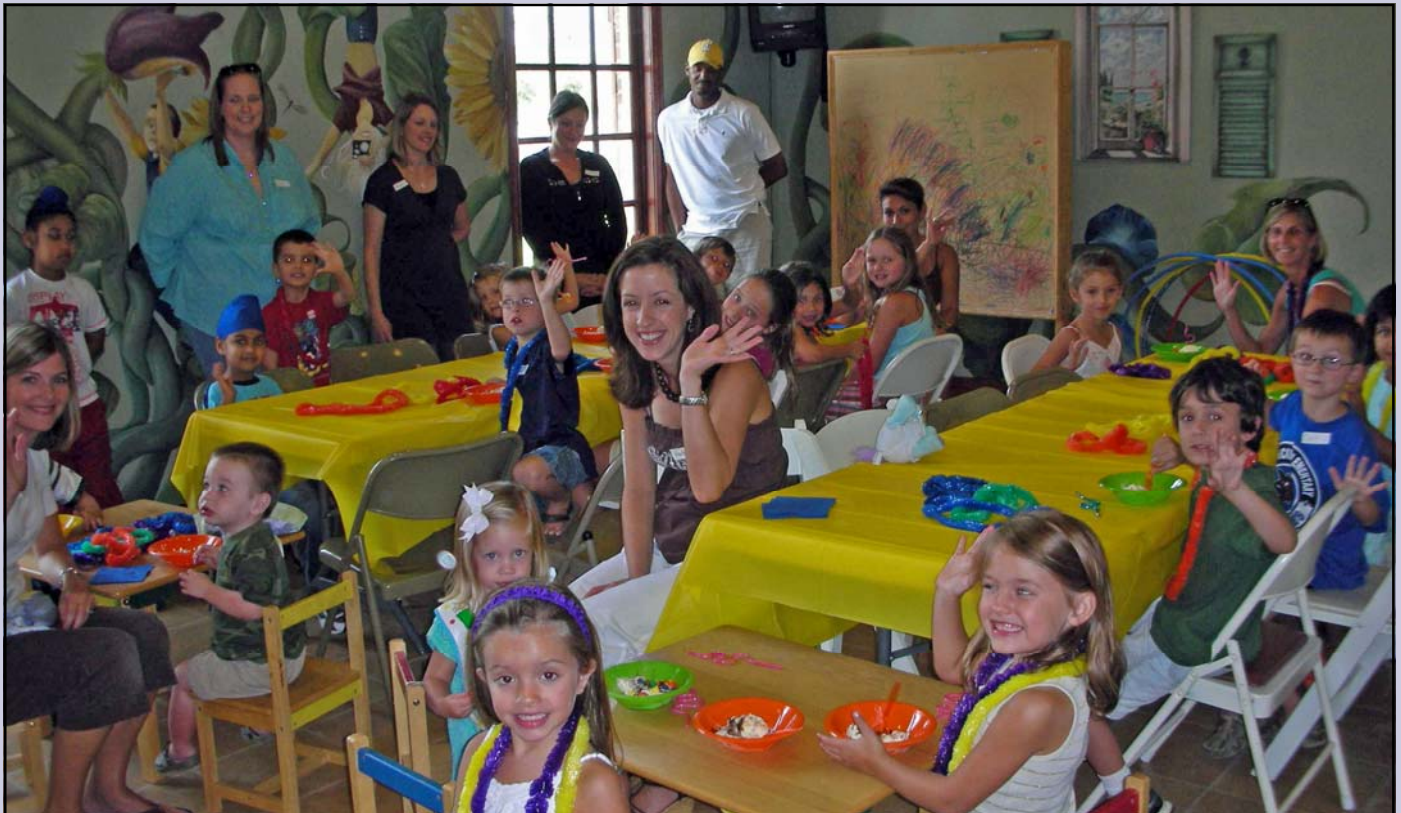
Kindergarten Ice Cream Social